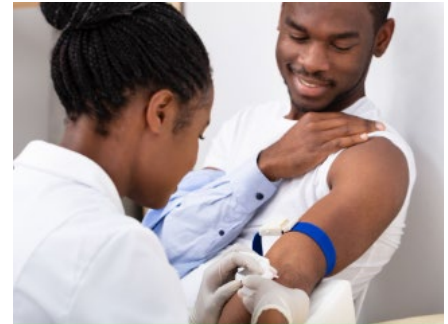
Lab Tests & X-Rays